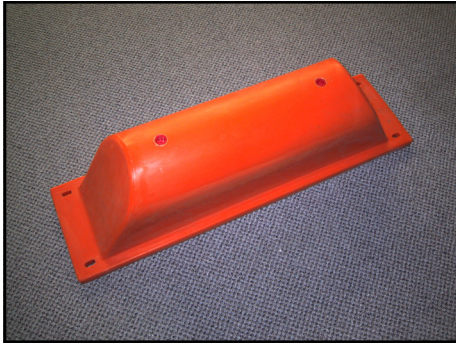
PermaBoom float (orange standard, yellow and black also available)