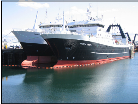
PermaBoom deployed around vessels in port (24 hour protection)