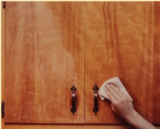
Perfect for dry or water damaged cabinets.

Feed-N-Wax was developed to be the perfect follow-up to Restor-A-Finish when you want to maintain that “just-restored” look to your wood finish. Over time, wood furniture, cabinets, and especially antiques, tend to “dry out” and fade. Feed-N-Wax helps introduce conditioning oils that “feed” the wood, while leaving behind a protective coating of beeswax and Brazilian carnauba wax to polish and shine. Feed-N-Wax may be used whenever the wood or wood finish looks faded or dry.